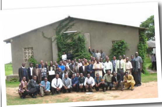
Zambian Pastors at the conference

Second, a spirit of brokenness came. Right after the opening message, there was a time of silent prayer followed by a time of prayer where leaders took turns praying aloud. This was not directed by our team in any way...we didn't say, "pray for ____." Yet, the Spirit moved hearts to cry out to the Lord in repentance. Repentance for having wrong priorities, repentance for sins, repentance for not reaching out to the lost, repentance for not discipling the next generation... On and on the prayers came - Some in shouts and some in softness, some with anger and some with weeping, some in English and some in local dialects...all directed toward the one true God of the universe. All asking God to lead us where He wills and to empower us to obey and follow His directing. What a powerful time of humble submission!