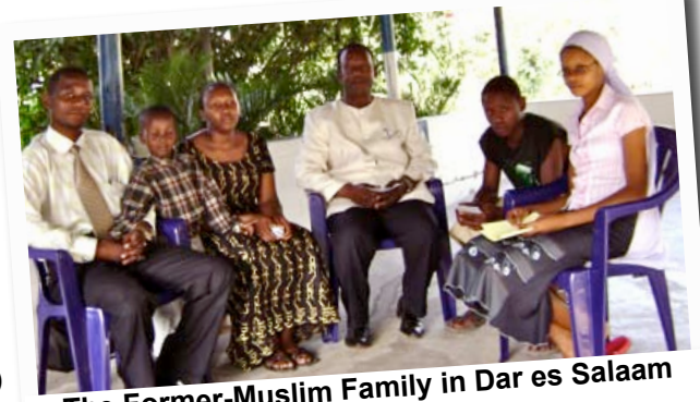
The Former-Muslim Family in Dar es Salaam

Now...2 months later... our mini-bus pulled up one afternoon to do outreach in the same village. This same young girl met us as we arrived and (through the interpreter) expressed her desire to be born again right then! It was unusual that someone would approach us in that way, and I asked about her situation and learned the details of the above story. I was amazed that the pastor had not led her to faith in Christ when he prayed over her previously! Why he didn't, I still don't know...but nevertheless, we shared the Gospel and she eagerly placed her faith in Christ as Savior immediately, along with a friend that was there with her.